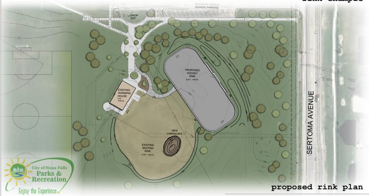
proposed rink plan