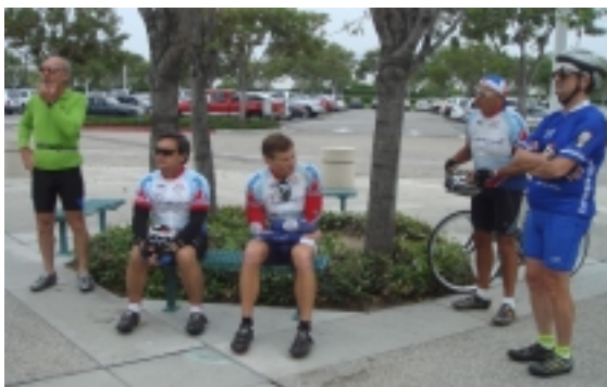
The group starts out from the Irvine Amtrak station