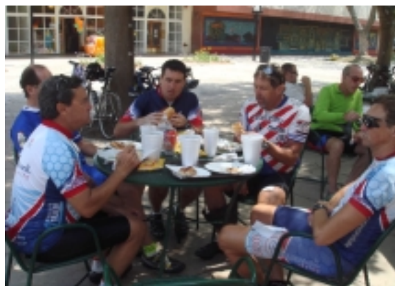
Everyone enjoys a long awaited lunch in Riverside