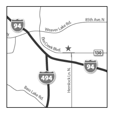
North Memorial Rehabilitation Services Arbor Lakes Medical Building 12000 Elm Creek Blvd. Suite 210 Maple Grove, MN 55369