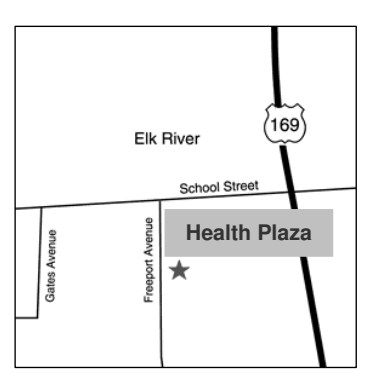
North Memorial Rehabilitation Services North Memorial Health Plaza 800 Freeport Ave. N. Suite 102 Elk River MN, 55330