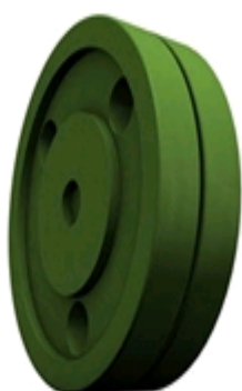
The green biscuit is for dryland stick handling

Topeka hockey players don't have ice year round or consistently during hockey season. This can pose a challenge when young players want to improve their game and Mom and Dad don't feel like driving to Kansas City to find an open sheet in July. Here are a few ideas to keep your player sharp and give them a chance to refine their skills at home!