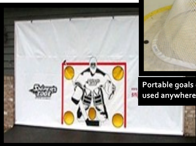
Garage goalie, designed to attach to an open garage