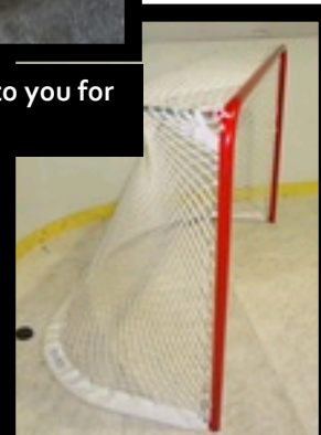
Portable goals can be used anywhere