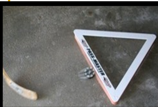
The PassMaster rebounds the puck to you for repeated play

TIP: Stick handling should be practiced as often as possible, on or off the ice! This is something that can be done alone or grab some friends and play a game of pick-up in the driveway