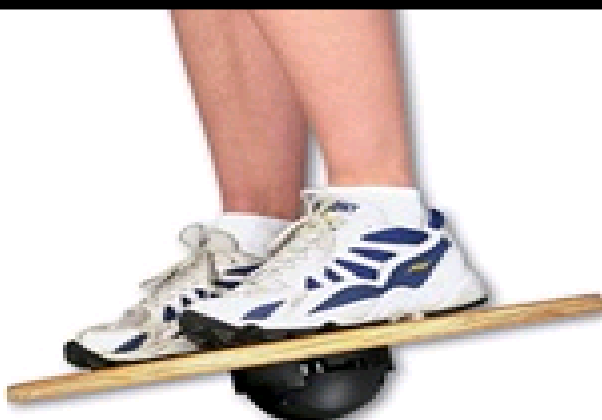
Take it up a notch and try stick handling on a wobble board to build core muscles and improve balance!

These are just a few ideas to get you started. The internet offers many of other ideas and resources for dry land hockey practice. Check it out, or email your coach for specific recommendations to improve your game! PS— Many a pro player practiced stick handling with a crushed can or an old tennis ball in his parent's basement. Hockey on!