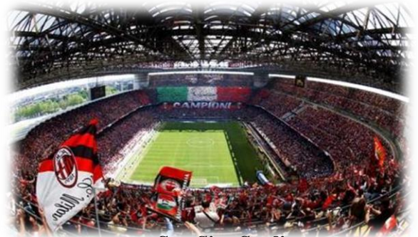
San Siro Stadium

Following breakfast the group will have the morning and early afternoon at leisure in Milan for sightseeing and shopping. In the afternoon the group will attend a second Serie A match at San Siro Stadium, home to AC Milan and Inter Milan. Farewell dinner at local Milanese. (Como)