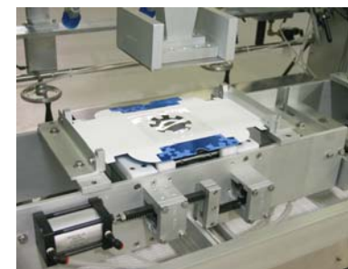
Simplix Forming Tool