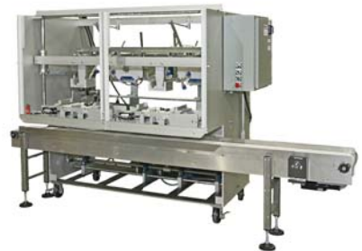
LS70D Dual Head Former