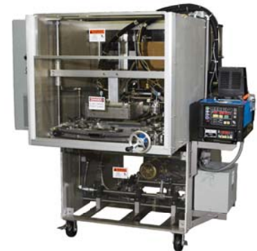
GF42S Shuttle Former