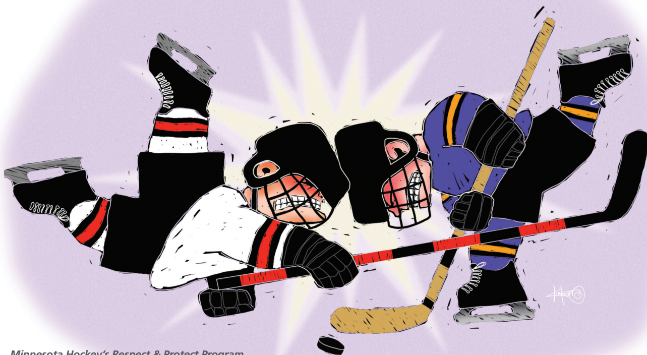
FILE ILLUSTRATIONS BY KIRK LITTLE

Minnesota Hockey's Respect & Protect Program focuses on prevention of concussions.