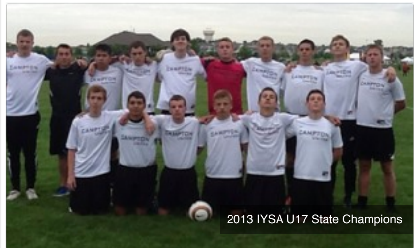
2013 IYSA U17 State Champions

The two teams having different birth dates allows many players the opportunity to “try-out” with a new assembly of players. Boys who now fall into a birth year team have the opportunity to be leaders on the team in terms of their age/experience they bring to the team.