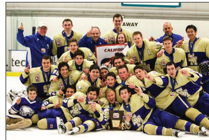
Santa Margarita Eagles - 2013 National Champions