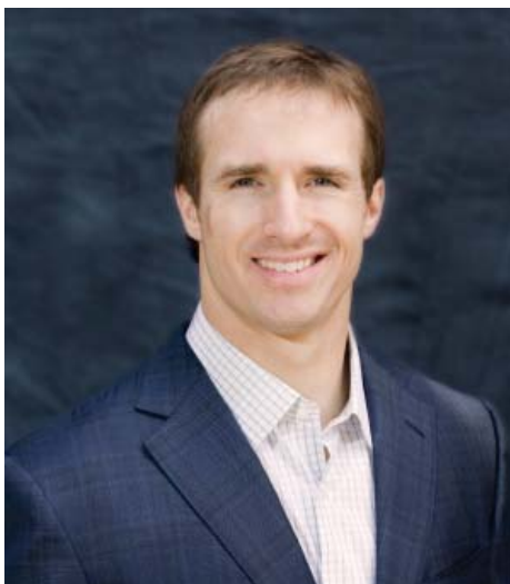
Drew Brees - Sports Illustrated's Sportsman of the Year