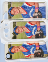
iPhone4/4s Galaxy S3 iPhones