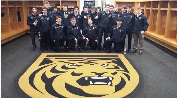
E15s at Colorado College in 2013

Travel to the US to play American teams and tour college campuses