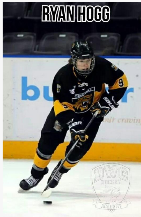
Cowichan Valley Capitals