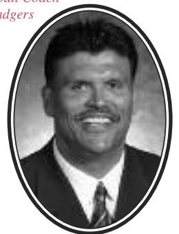
ANTHONY MUNOZ NFL Hall of Fame Offensive Tackle (Rated Best Tackle in History)