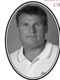
TIM KRUMRIE Former Badger Great All-Pro Defensive Lineman