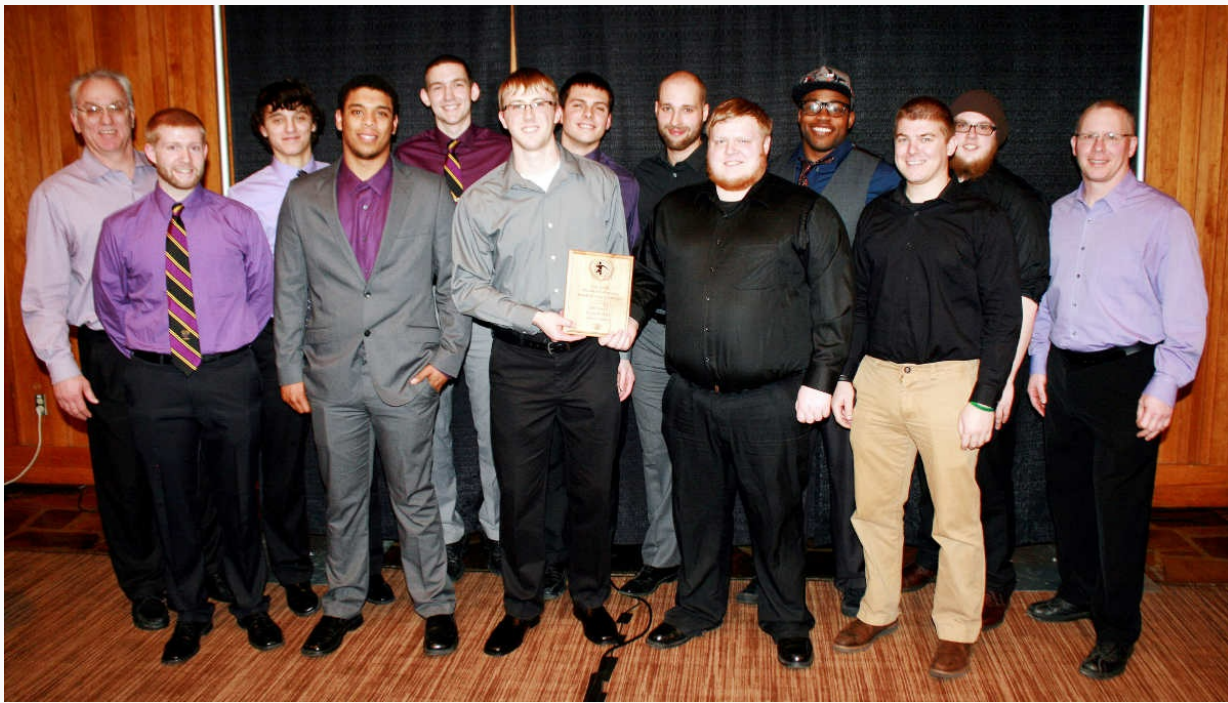
Second Place Minnesota State Mankato men's handball team.