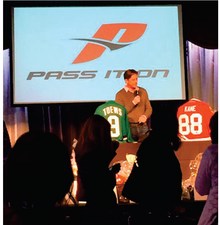
Former Chicago Bears wide receiver Tom Waddle took part in the Eclipse Select Casino Night benefiting Pass It On, Inc., in March of 2015.

The purpose of the foundation is to offer young athletes the opportunity to play competitive soccer through financial assistance to families with economic hardship.