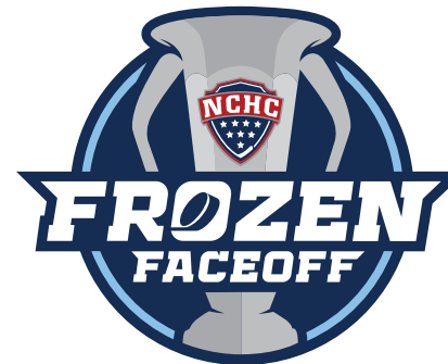
PRIMARY W/ OUT YEAR