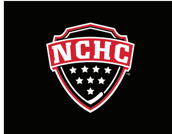
PRIMARY ON DARK