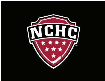
PRIMARY ON DARK