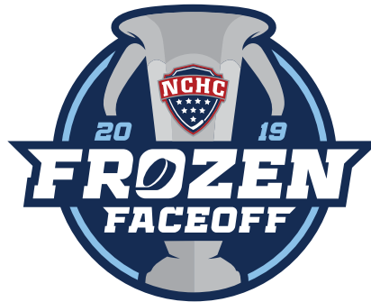
PRIMARY W/ YEAR