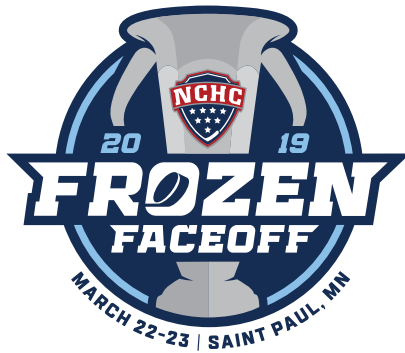
PRIMARY W/ YEAR, DATE, CITY

The space above the wordmark is the best incorporation for the year, as it'll be one of the main, if not, the main incorporation in the primary mark. The city & date are placed below the primary mark as this is not much of a main incorporation, and for which will be updated yearly.