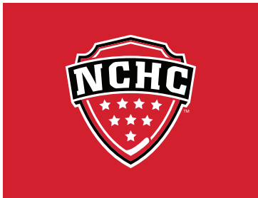
PRIMARY ON DARK