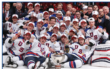
2017 U.S. NATIONAL JUNIOR TEAM