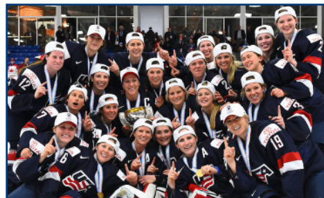
2017 U.S. WOMEN'S NATIONAL TEAM