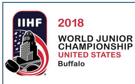
2018 IIHF WORLD JUNIOR CHAMPIONSHIP