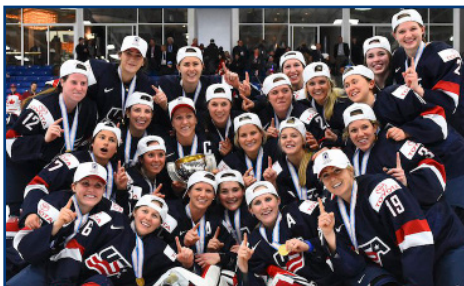
2017 U.S. WOMEN'S NATIONAL TEAM