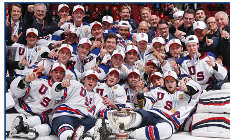
2017 U.S. NATIONAL JUNIOR TEAM