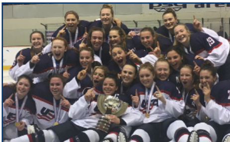
2017 U.S. WOMEN'S NATIONAL UNDER-18 TEAM