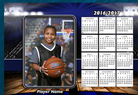
5x7 Calendar Magnets