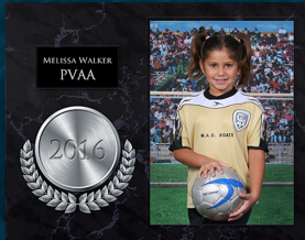
9x12 Wood Plaques