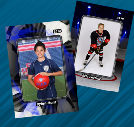
Pro Wallets & Trading Cards