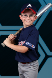
24 Inch Wall Cling