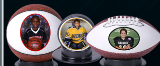
Mini Photo Balls