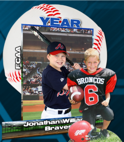
Designer & Plain Statuettes