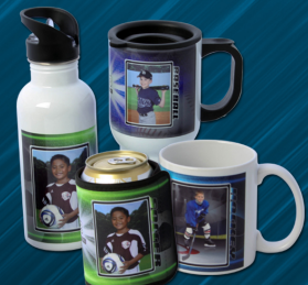
Koozies, Water Bottles & Mugs