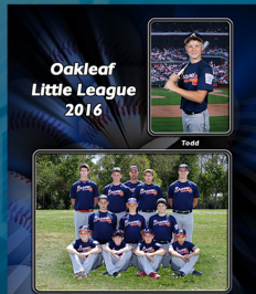
Designer Memory Mate