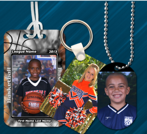
Bag Tags, Key Chains & Dog Tags