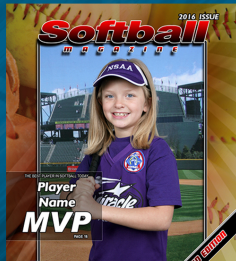
Designer Magazine Cover