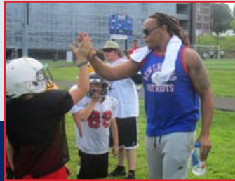
JABAAL SHEARD Linebacker Indianapolis Colts