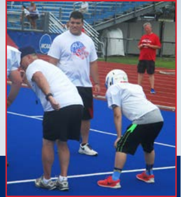
CHRIS JONES Defensive Tackle New England Patriots