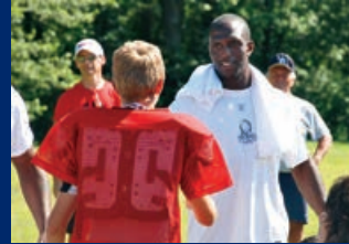
DEVIN MCCOURTY Defensive Back New England Patriots