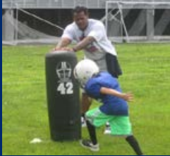
DONT'A HIGHTOWER Linebacker New England Patriots

Some of the Patriots that have instructed at the academy include: Joe Andruzzi, Brandon Bolden, Tom Brady, Troy Brown, Teddy Bruschi, Matt Cassel, Patrick Chung, Roosevelt Colvin, Dominique Easley, Buddy Farnham, Kevin Faulk, Stephen Gostkowski, Duron Harmon, Dont'a Hightower, Ellis Hobbs, Brian Hoyer, Damon Huard, Chris Jones, Nick Kaczur, Dan Koppen, Matt Light, Devin McCourty, Willie McGinest, Zoltan Mesko, Lawyer Milloy, Logan Mankins, Brandon Merriweather, Asante Samuel, James Sanders, Jabaal Sheard, Adam Vinatieri, Ty Warren, Benjamin Watson, Scott Zolak, and more!