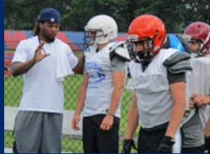
DURON HARMON Cornerback New England Patriots