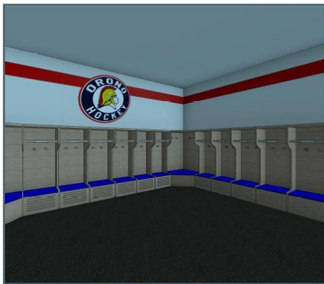
VARSITY LOCKER ROOM VIEWS

When the Orono Ice Arena was originally constructed, there were limited funds and certain things simply were not in the budget. None of the locker rooms, as originally constructed, have shower facilities and there are not sufficient restroom facilities adjacent to the locker rooms. In addition, the spaces used for the high school locker rooms are in fact storage rooms and lack proper ventilation and enough space for this usage. Aside from the desirability of showers, adequate restrooms and improved locker room facilities, these upgrades will also attract other customers for the Orono Ice Arena and enhance revenue generation that will benefit both the Orono Ice Arena and Orono's own hockey programs.