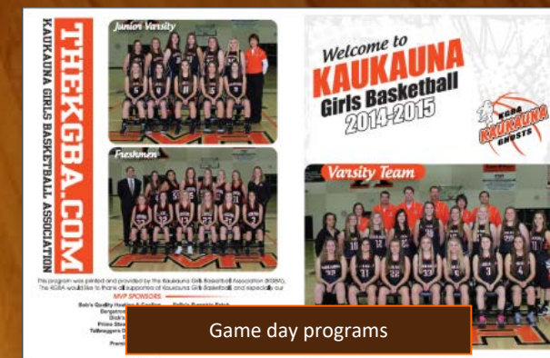
Game day programs