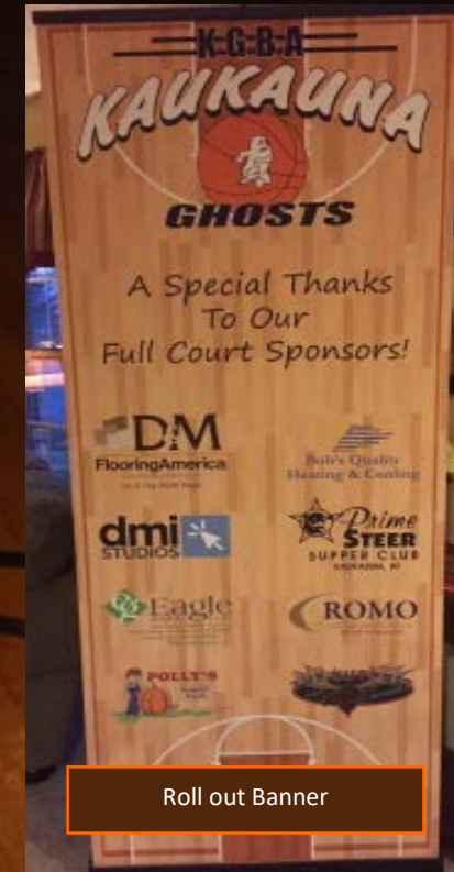
Roll out Banner