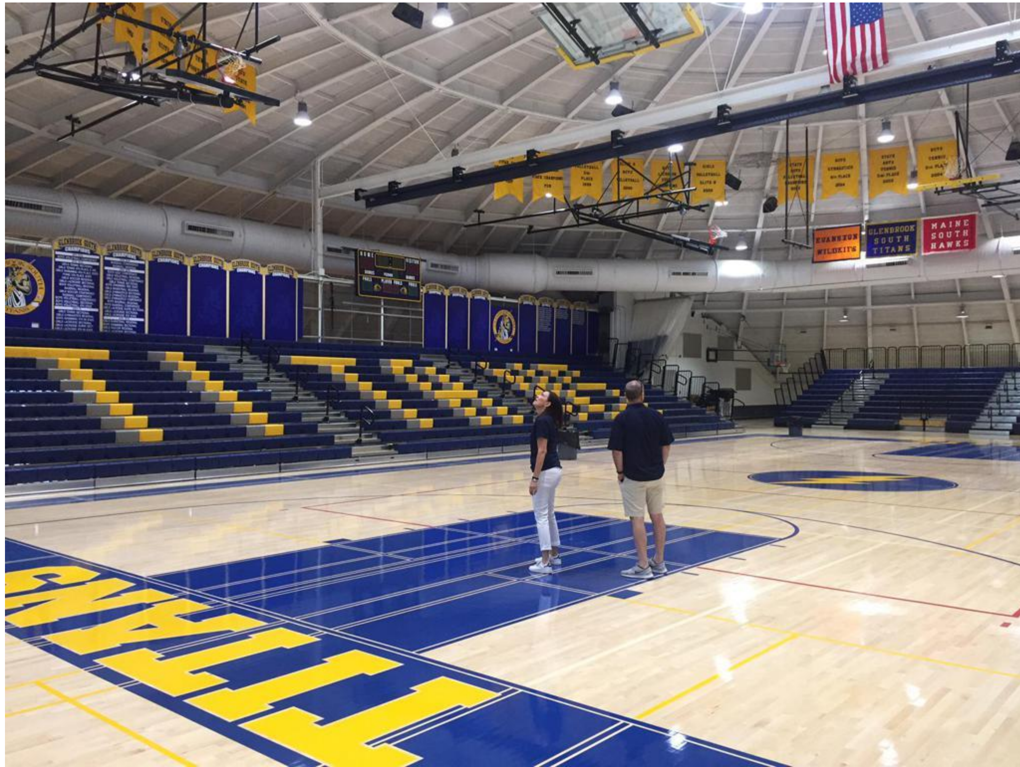
Titan Dome Restored