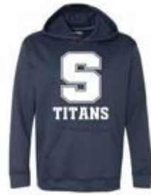
Navy GBS Hoody

Titan wear makes a great gift for any occasion.