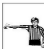
ROUGHING & FIGHTING