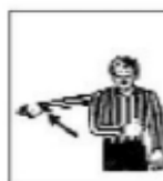
DELAY OF GAME