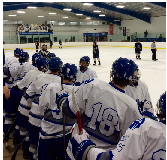
Lake Catholic faces off against Shaker Heights at Thornton Park last Friday