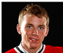
Patrick Kane Buffalo, N.Y. native 3x Stanley Cup Champ