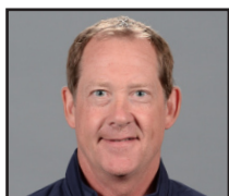
Phil Housley Buffalo Sabres Head Coach