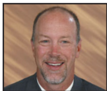
Mike Ramsey Buffalo Sabres 1980 U.S. Olympian