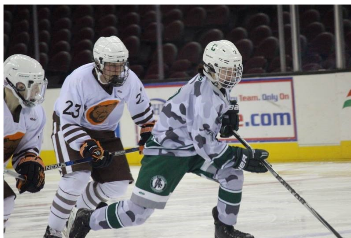
PHOTO: Lake Catholic and Padua do battle last season. The Cougars were 2-0-0 against the Bruins.

The University School Preppers are idle this week.