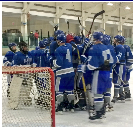
Gilmour Academy celebrates a win at the Cold Turkey Shootout over the Thanksgiving Weekend. The Lancers have won six games in a row.