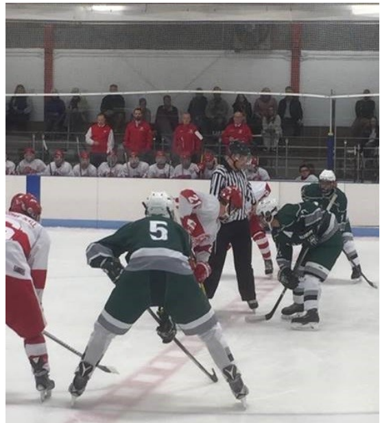
Lake Catholic faces off against Shaker Heights at Thornton Park last Friday