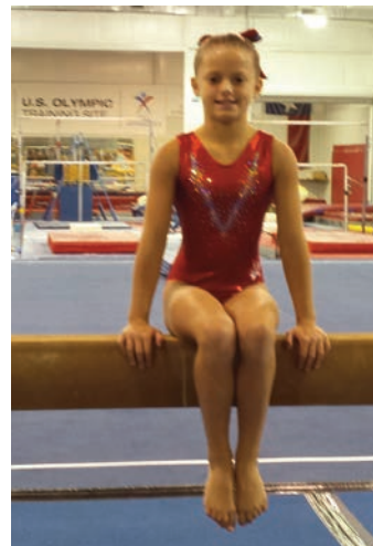
Wells Fischer Arena Gymnastics Connecticut