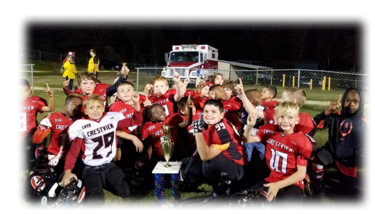
Winners of the 2017 Stars & Stripes Bowl (Red Level, AL)

Juniors ......(9 - 10 yr old) Seniors ......(11 -12 yr old)