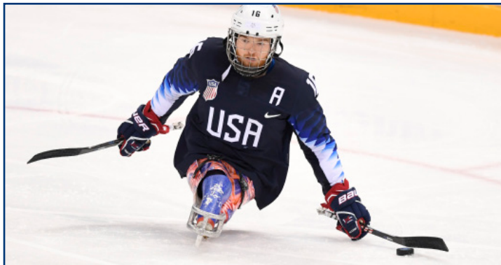
Alternate captain and forward Declan Farmer shares the U.S. record for most goals in Paralympic history with 11