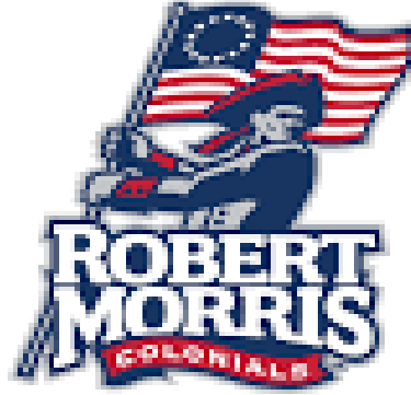
Nick Lamica '13