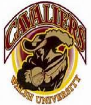
Sal Sidebotham '17