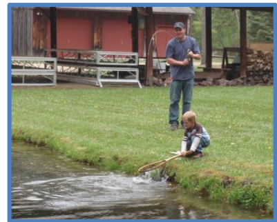
A Great Place For The Family