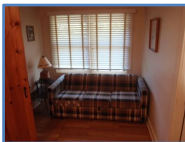
Bedroom 1 - Hide-a-Bed