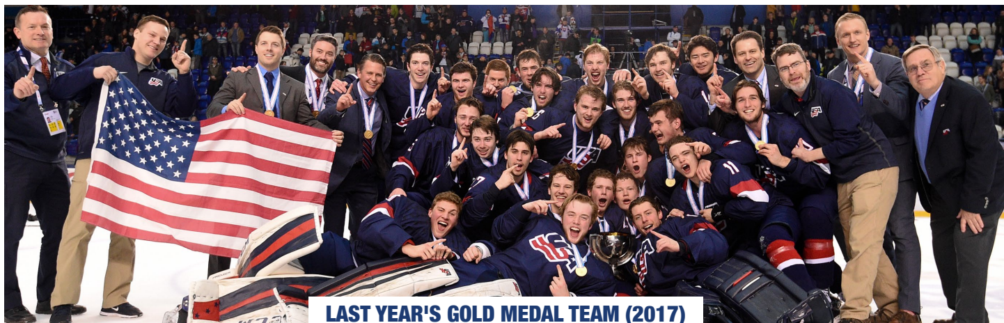
LAST YEAR'S GOLD MEDAL TEAM (2017)

On Saturday (April 21) Team USA earned its first USHL postseason victory with a 3-0 shutout against the Chicago Steel in the Eastern Conference Semifinals. On Friday (April 27), the NTDP won its first ever USHL playoff series after winning in overtime in back-to-back road games in Chicago. Team USA will face the Youngstown Phantoms in the Eastern Conference Finals. The series is set to kickoff on Tuesday (May 1) at USA Hockey Arena in Plymouth.