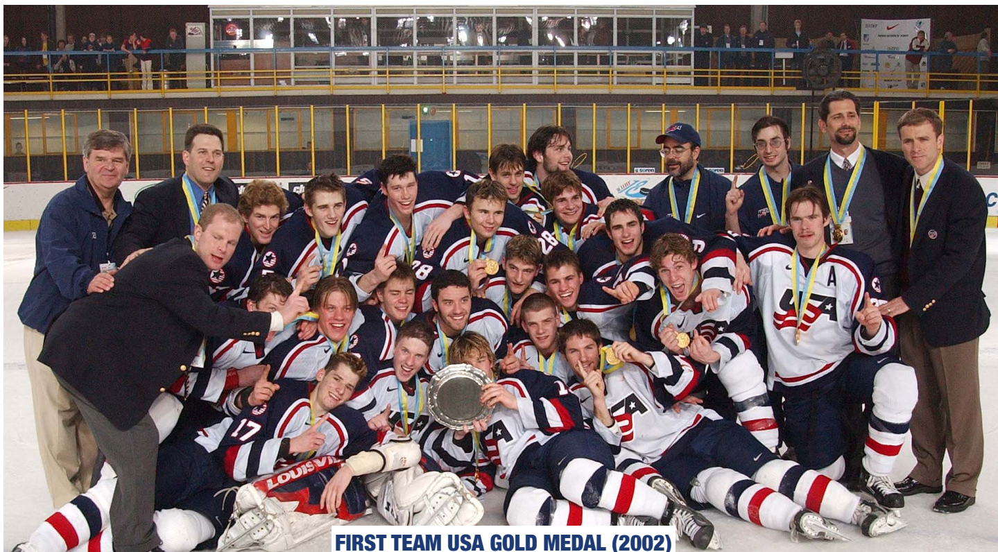
FIRST TEAM USA GOLD MEDAL (2002)