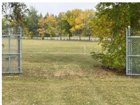
15 Foot opening leaving and re-entering the track