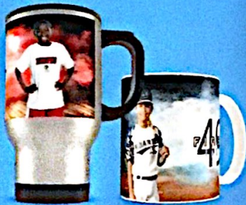
Travel Mug & Coffee Mug