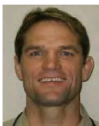
ND Coach of the Year MATPAC Head Coach