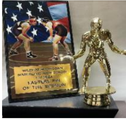
Fastest Pin Plaque Awarded Per Session