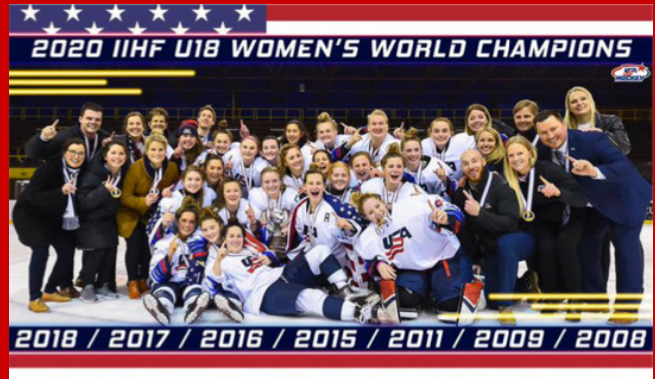
U22 SELECT & U18 WNT