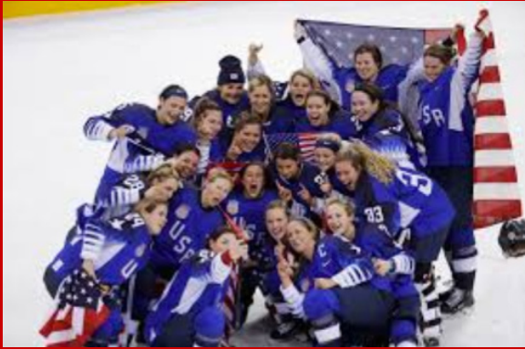
OLYMPIC & NATIONAL TEAM