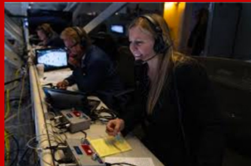
COACHING, BROADCASTING, VIDEO, MARKETING, ETC...