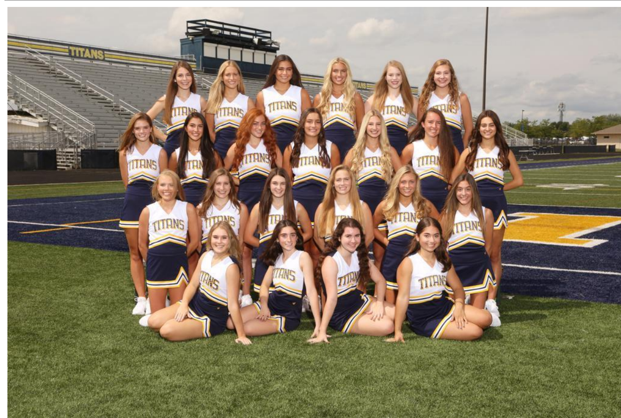
Titan Poms Dance Intensive