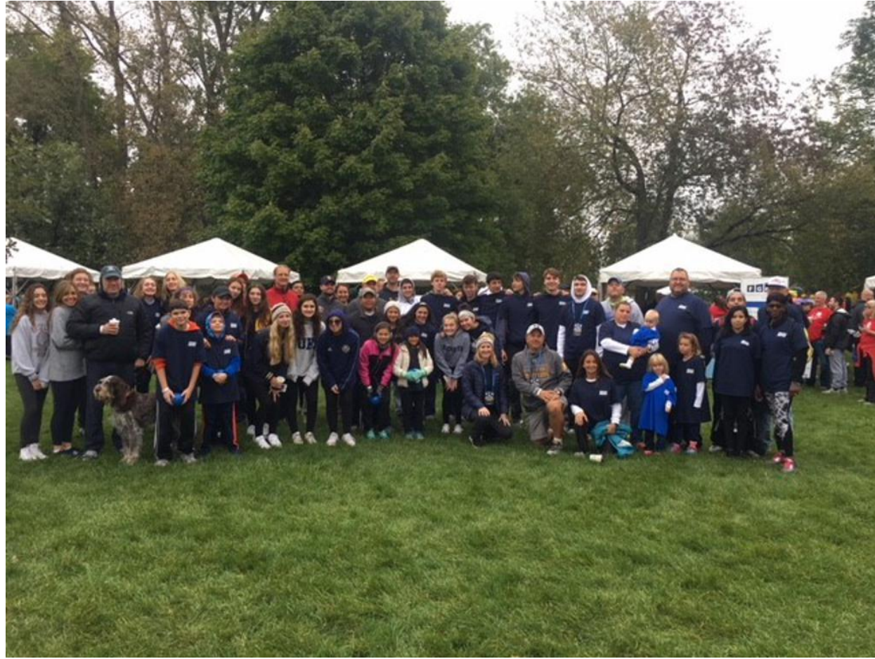
Titans Helping Titans