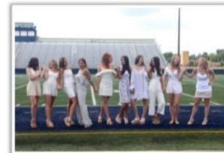
Come join in on the fun!

Register on our website under Special Events at www.titanpoms.weebly.com