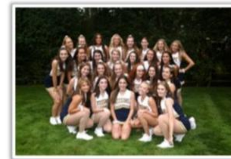
The Varsity Titan Poms