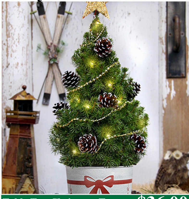
Table Top Christmas Tree

The Candlelit Centerpiece $35.00 This seasonal centerpiece, as pictured, is bursting with naturally scented mixed evergreens which stay fresh and moist from the floral foam base. The festive decorations are certain to delight your guests and lend a joyful air to your Holiday Celebrations. Size: Approximately 18" wide.