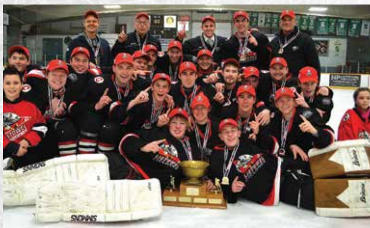
LISTOWEL CYCLONES JUVENILE BB-B