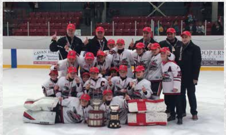
YORK SIMCOE EXPRESS MINOR ATOM AAA