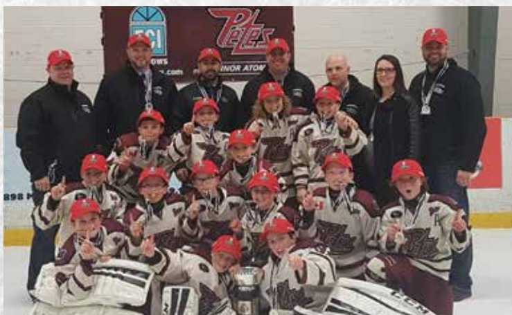
PETERBOROUGH MINOR PETES MINOR ATOM AA