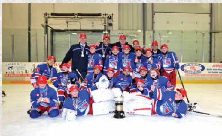
OAKVILLE RANGERS MINOR ATOM AE 1-2