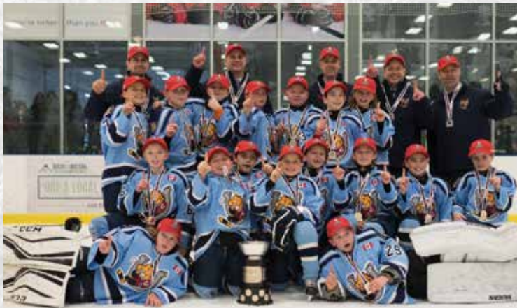
BARRIE COLTS ATOM AE 2