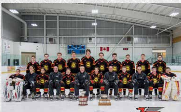
GUELPH JR. GRYPHONS MINOR BANTAM AAA