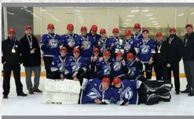
MARIPOSA LIGHTNING BANTAM C