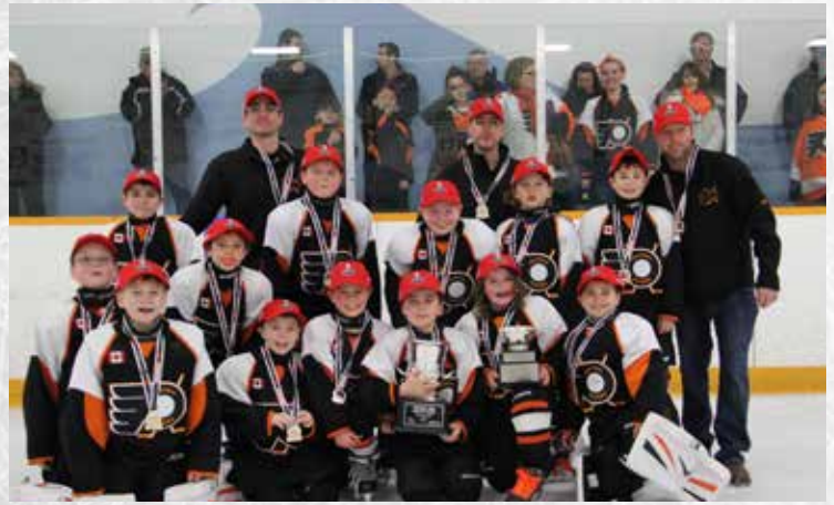
FRONTENAC FLYERS NOVICE EAST CC-C