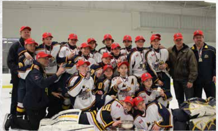
BURLINGTON EAGLES MINOR BANTAM A