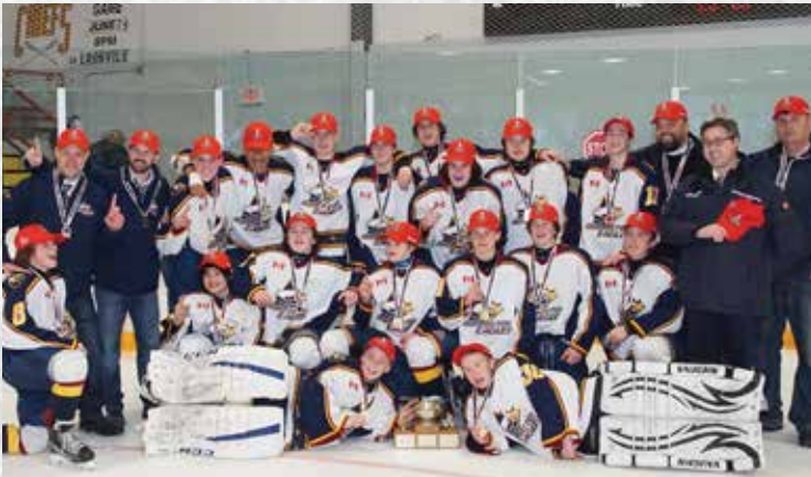
BURLINGTON EAGLES GOLD MINOR BANTAM AA