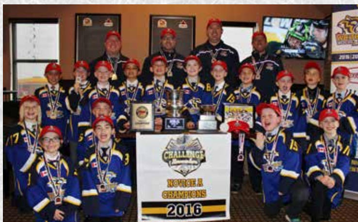
WHITBY WILDCATS BLUE NOVICE EAST A