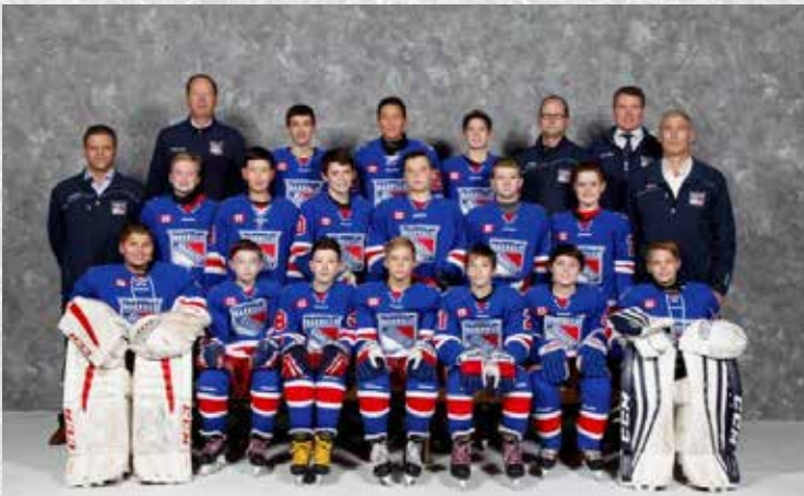
OAKVILLE RANGERS PEEWEE A