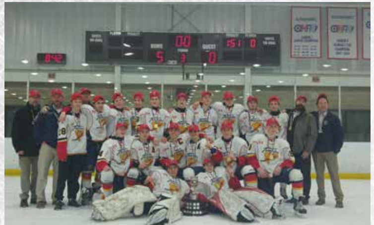
TNT TORNADOS MINOR MIDGET AA