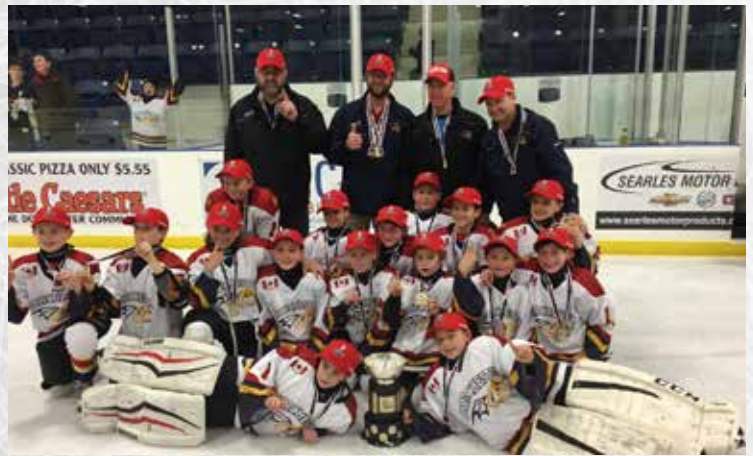
DORCHESTER DRAGONS ATOM AE 3-5