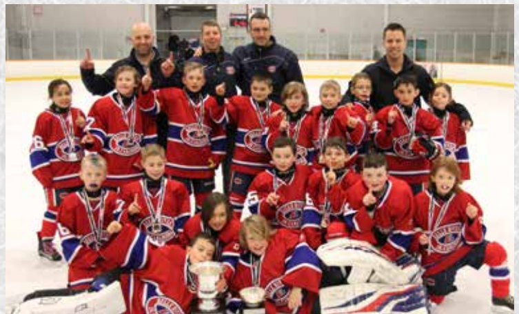
BELLE RIVER CANADIENS NOVICE WEST AE 1-2