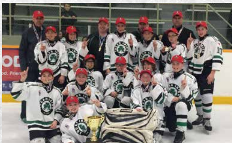
LUCAN IRISH PEEWEE C