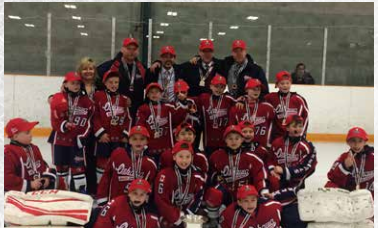
OSHAWA MINOR GENERALS NOVICE EAST AE 1-3