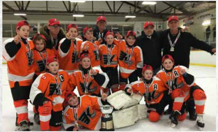
KINCARDINE KINUCKS ATOM B