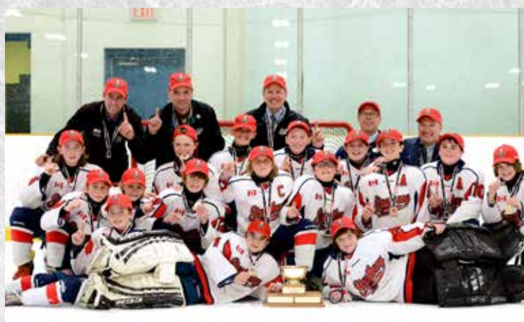
STRATHROY ROCKETS PEEWEE 3-5