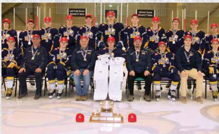
DUNNVILLE MUDCATS BANTAM CC