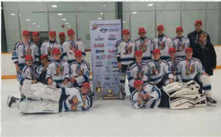
BARRIE COLTS BANTAM AE 2