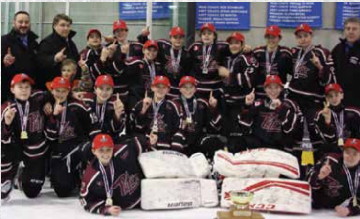
PETERBOROUGH JR. PETES MINOR BANTAM AE 1-2