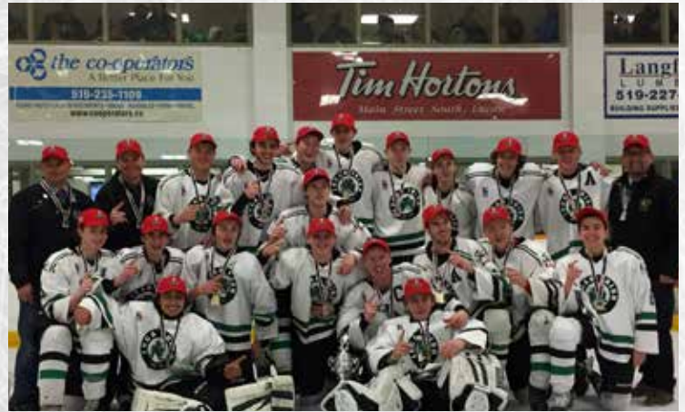
LUCAN IRISH MIDGET C