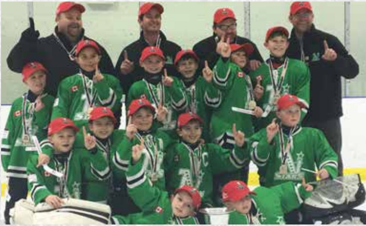
NAPANEE STARS NOVICE EAST BB-B