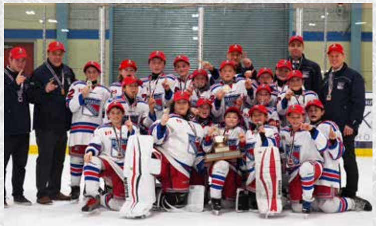
OAKVILLE RANGERS MINOR PEEWEE AE 1-2