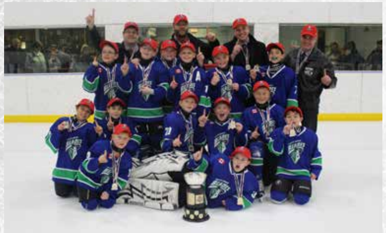
SOUTH BRUCE BLADES ATOM C