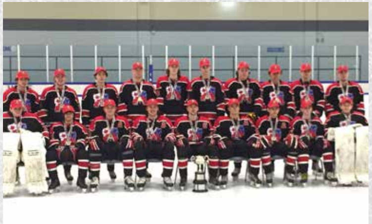
MOORETOWN JR FLAGS MIDGET B