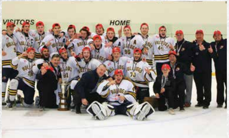
BRADFORD BULLDOGS MIDGET A