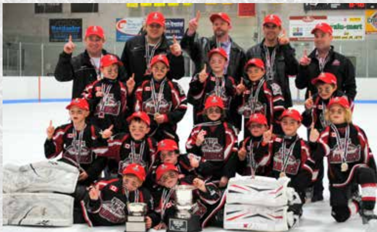
SOUTH HURON SABRES NOVICE WEST CC