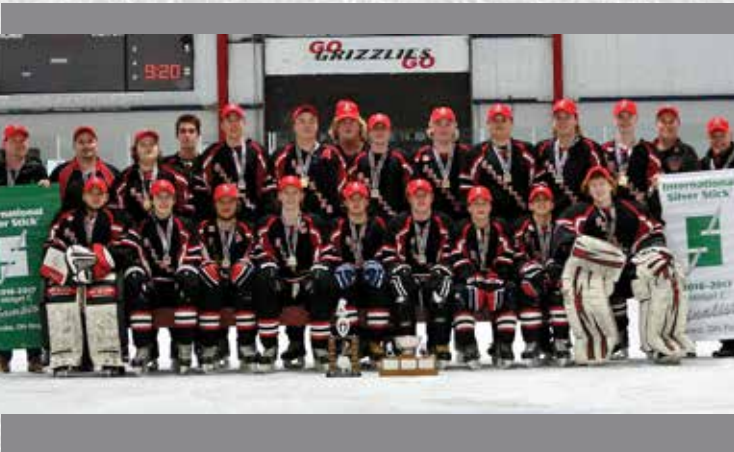
CENTRE HASTINGS GRIZZLIES MIDGET DD-D