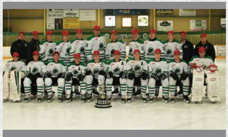
PELHAM PANTHERS MINOR MIDGET BB-D