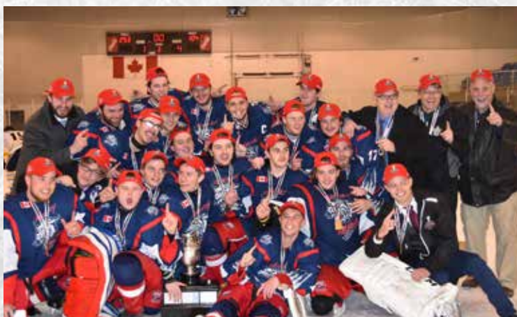
WOOLWICH WILDCATS JUVENILE A