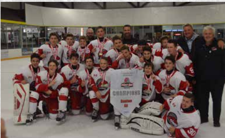
GARDEN CITY FALCONS BANTAM AA