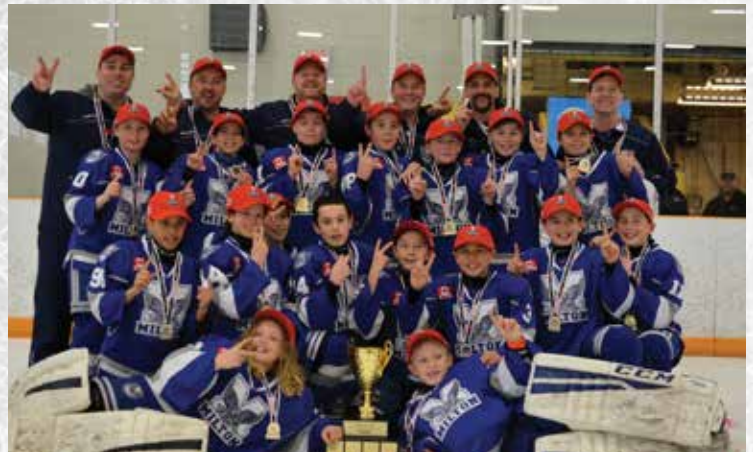
MILTON WINTERHAWKS MINOR PEEWEE AA