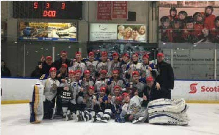
WHITBY WILDCATS MINOR MIDGET AAA