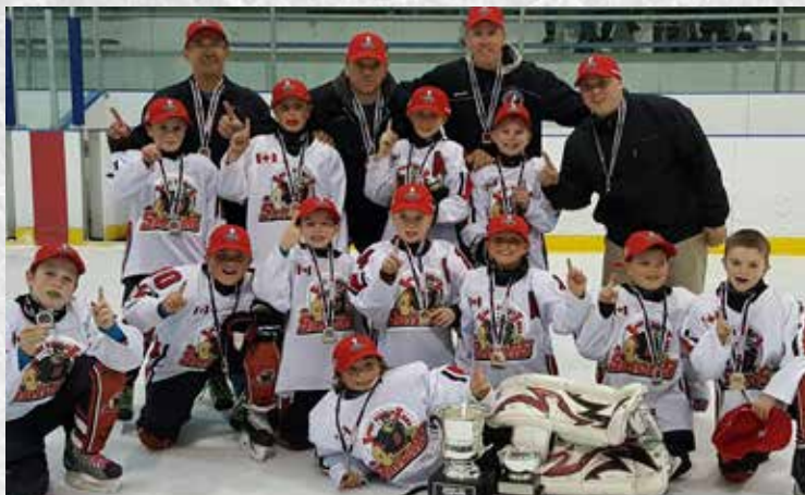
PORT STANLEY JR SAILORS NOVICE WEST DD-D