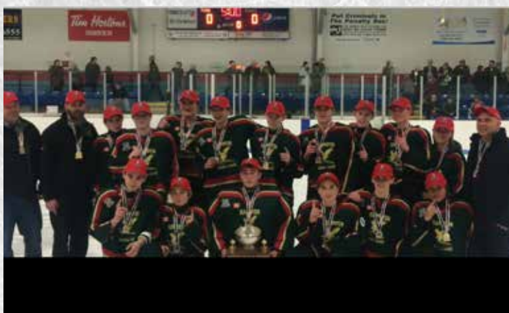
FLESHERTON GOLDEN HAWKS BANTAM DD-D