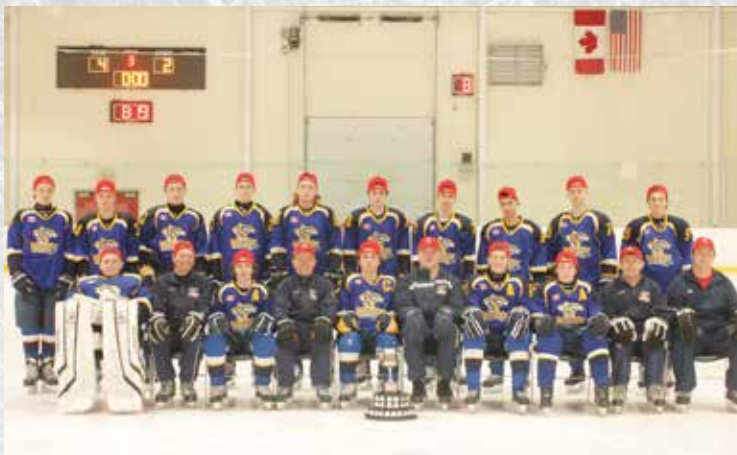
WHITBY WILDCATS MINOR MIDGET A