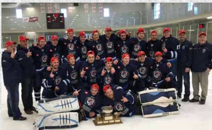
PORT DOVER PIRATES JUVENILE CC-C