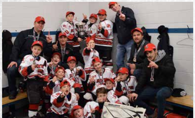
AYR FLAMES NOVICE WEST B