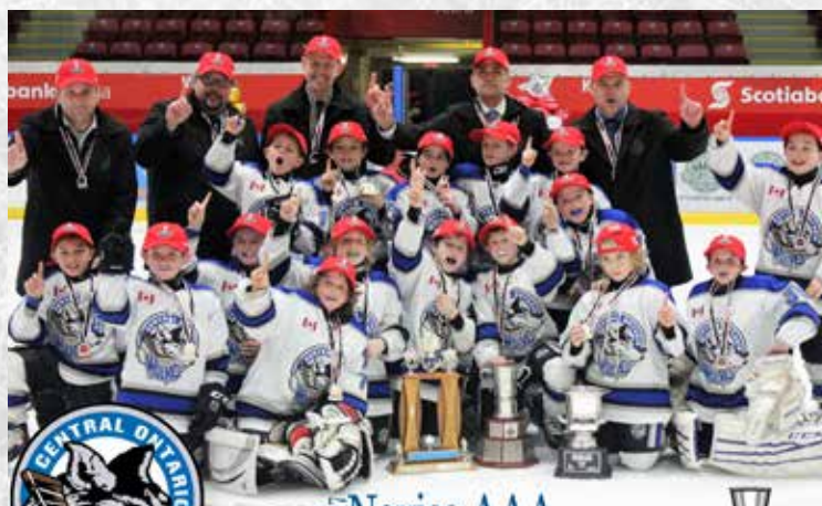
CENTRAL ONTARIO WOLVES NOVICE AAA