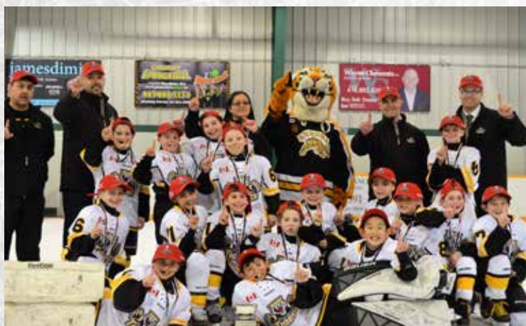
AURORA TIGERS NOVICE CENTRAL AA