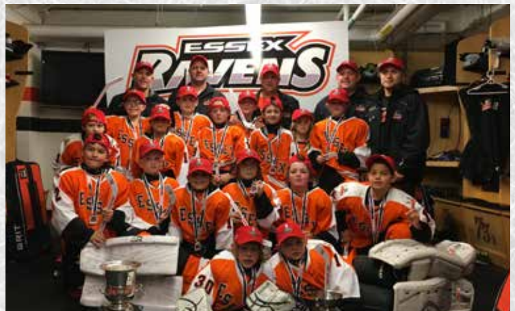
ESSEX RAVENS NOVICE WEST A