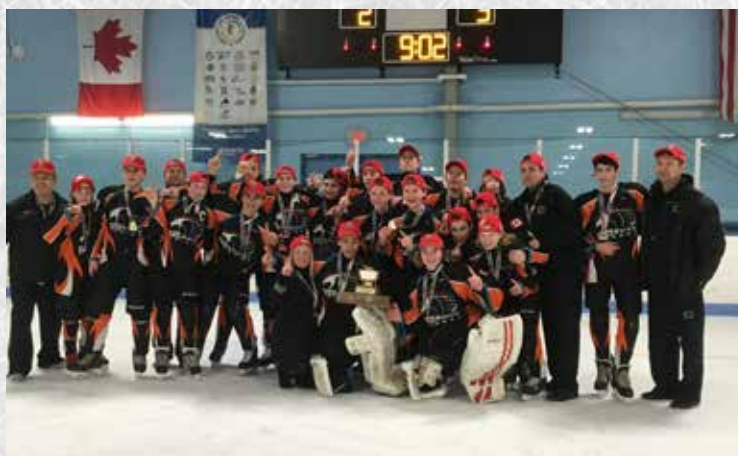
KENT COBRAS BANTAM AE 1