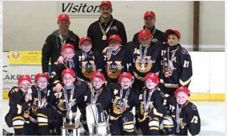
LUCKNOW SEPOY NOVICE WAAA JACOBI