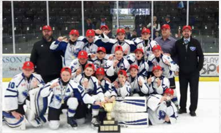
NORTHUMBERLAND NIGHTHAWKS PEEWEE AA