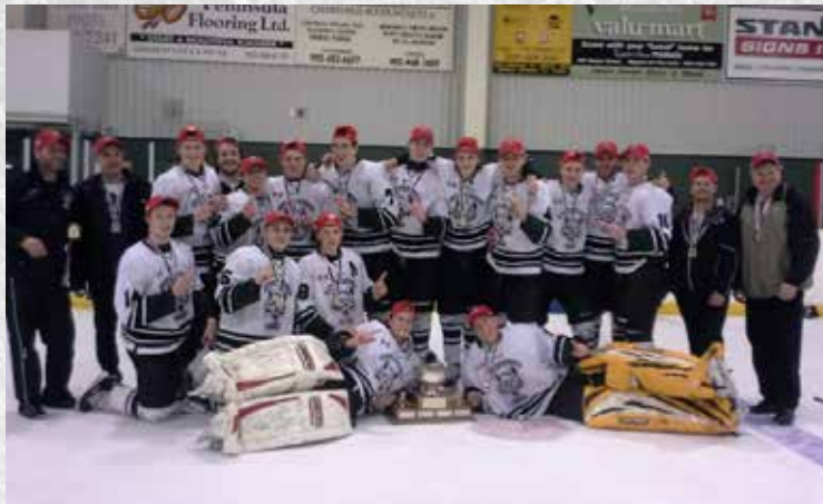
NIAGARA-ON-THE-LAKE WOLVES MIDGET BB