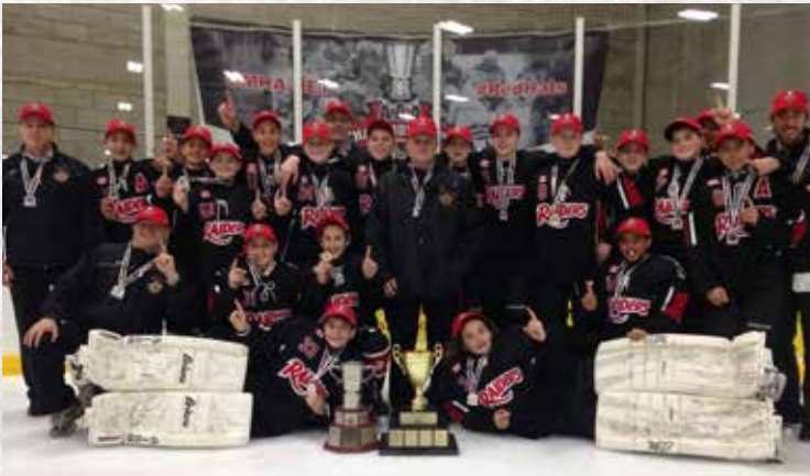
AJAX-PICKERING RAIDERS PEEWEE AAA