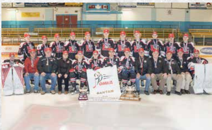
SOUTH MUSKOKA BEARS BANTAM BB