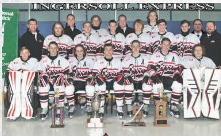
INGERSOLL EXPRESS BANTAM B