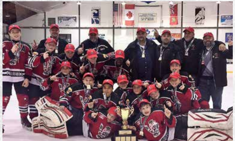
THOROLD BLACKHAWKS PEEWEE BB