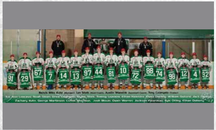
PELHAM PANTHERS BANTAM AE 3-5