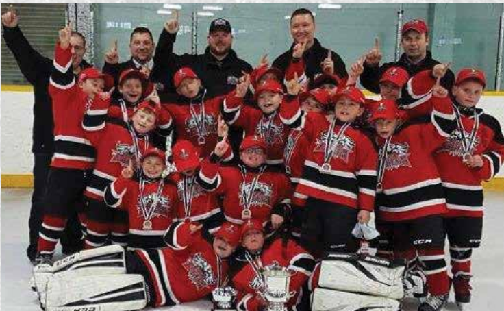
ESSA EAGLES NOVICE EAST DD-D