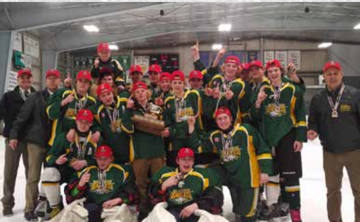
ENNISMORE EAGLES MIDGET AE 3-5