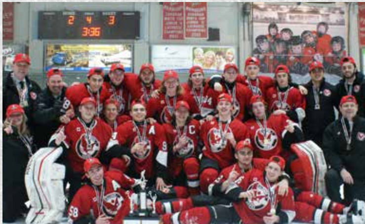
CALEDON HAWKS MIDGET AA