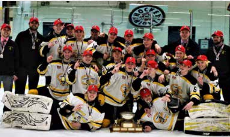
CAMPBELLFORD COLTS MIDGET CC