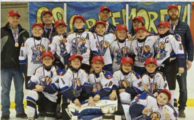
CREEMORE VALLEY HAWKS ATOM DD-D