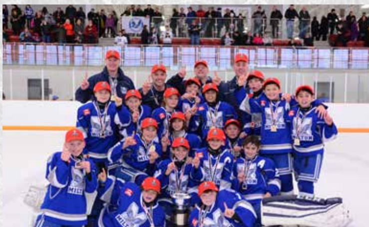
MILTON WINTERHAWKS ATOM AA