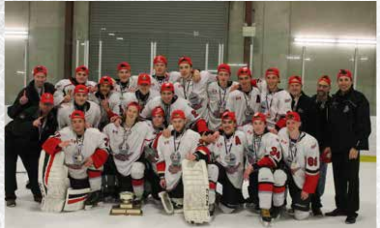
AJAX KNIGHTS WHITE MIDGET AE 1-2