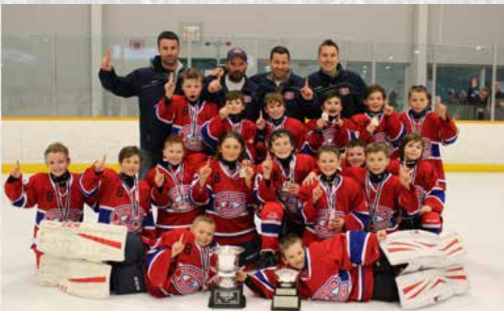
BELLE RIVER CANADIENS NOVICE WEST AA