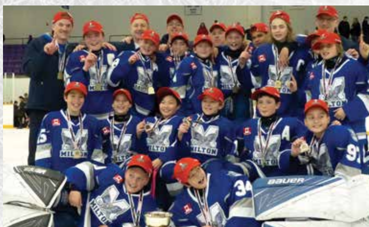
MILTON WINTERHAWKS PEEWEE AE 2