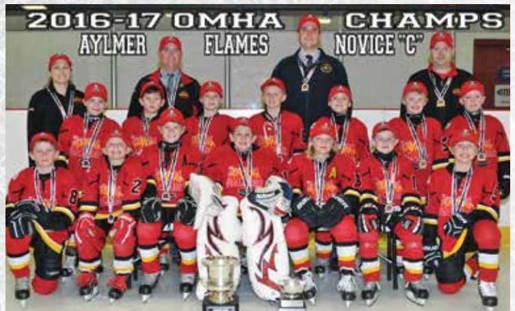
AYLMER FLAMES NOVICE WEST C