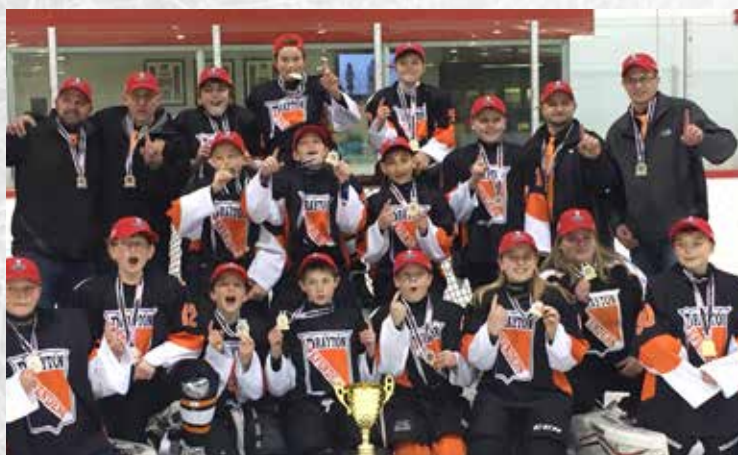
DRAYTON DEFENDERS PEEWEE DD-D