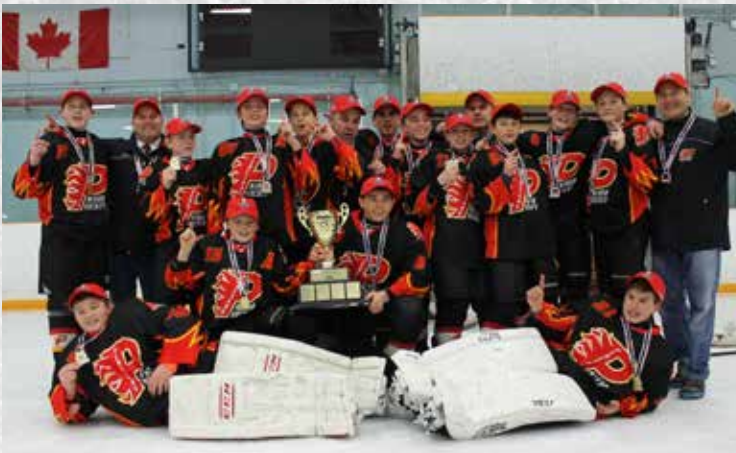
PENETANG FLAMES PEEWEE B