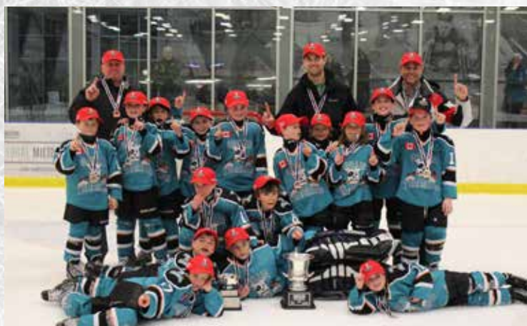
ORILLIA TERRIERS NOVICE CENTRAL AE 1