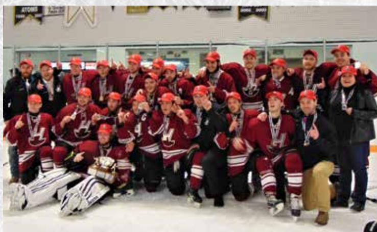
HONEYWOOD HURRICANES JUVENILE DD-D