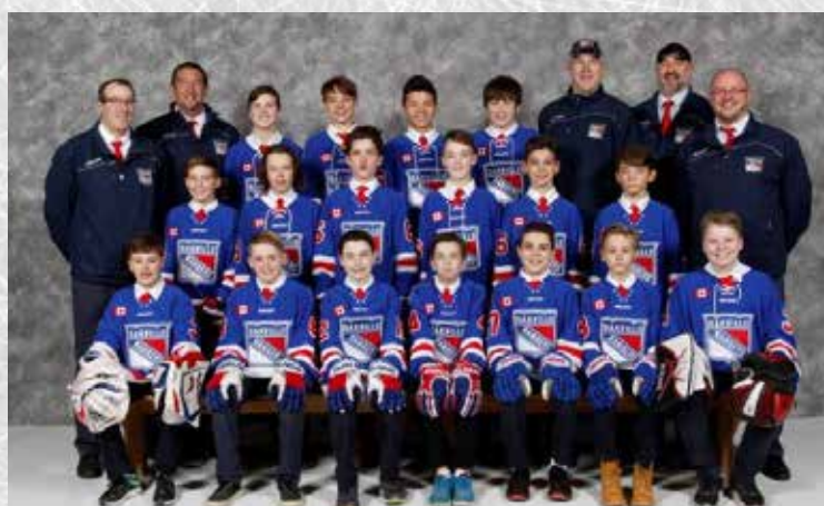
OAKVILLE RANGERS PEEWEE AE 1