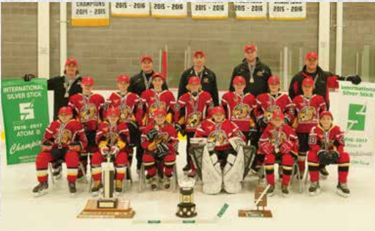
HANOVER FALCONS ATOM CC