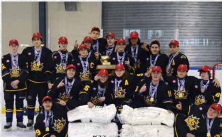
BRAMPTON 45's MINOR MIDGET AE 1-2