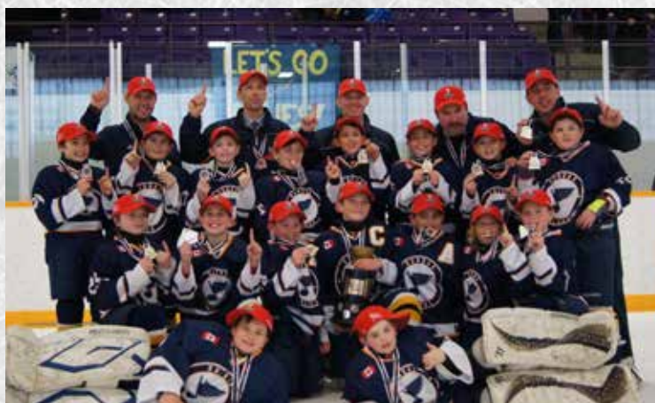
DUNDAS BLUES ATOM A