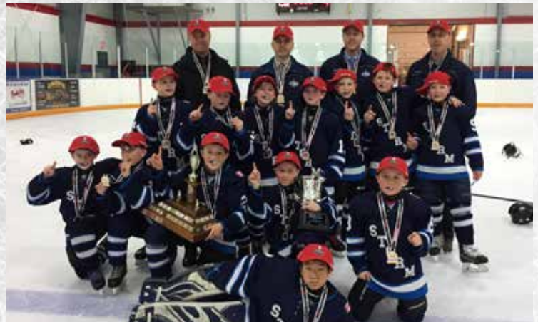
SAUGEEN SHORES STORM NOVICE WAAA TWOLAN