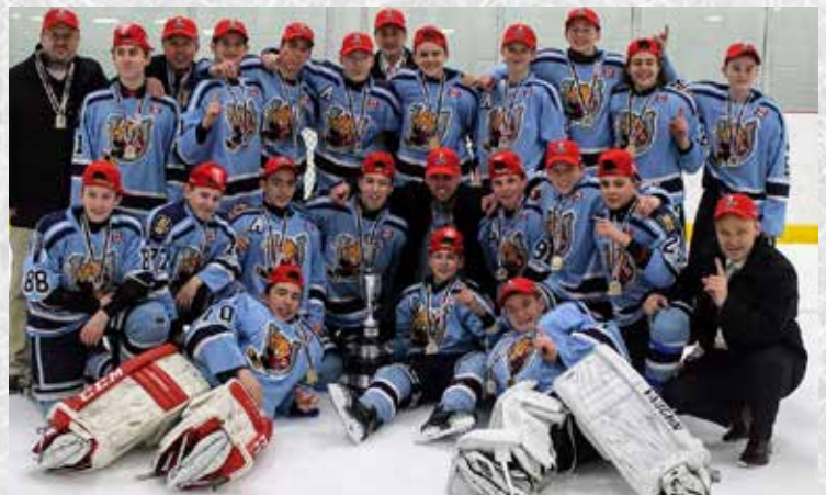
BARRIE COLTS WHITE BANTAM A