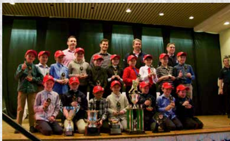
KINGSTON CANADIANS NOVICE EAST AA