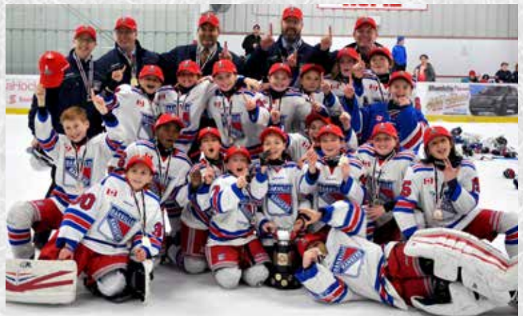
OAKVILLE RANGERS ATOM AE 1