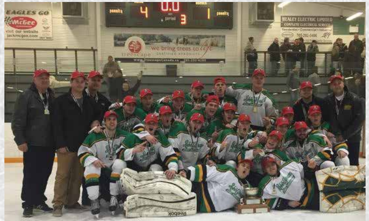
ENNISMORE EAGLES JUVENILE AAA-AA