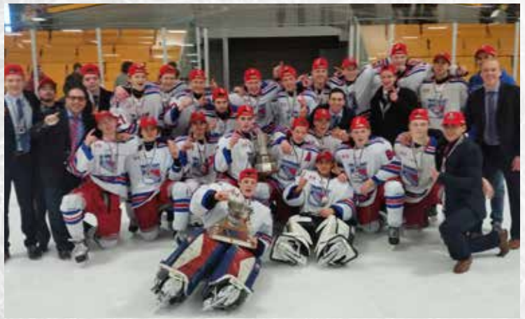
OAKVILLE RANGERS MIDGET AAA