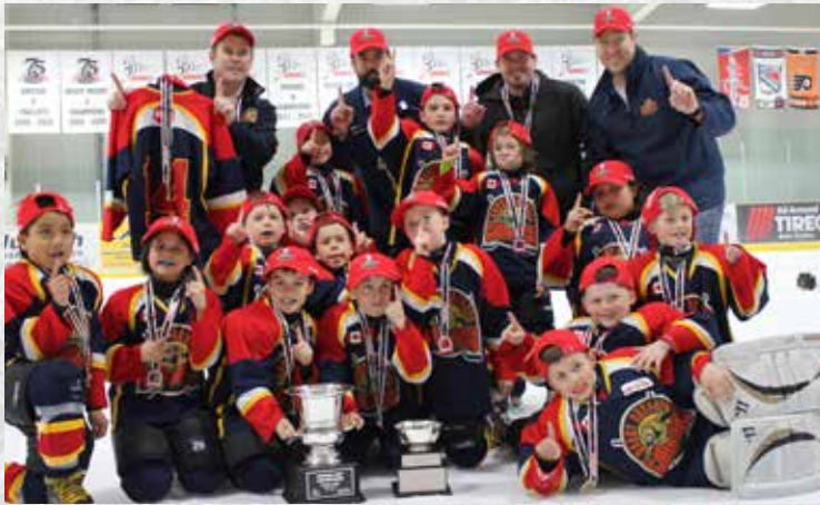
MOUNT BRYDGES COUGARS NOVICE WEST AE 3-4