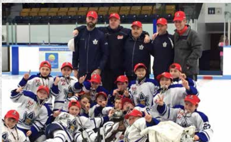
MARKHAM WAXERS ATOM AAA