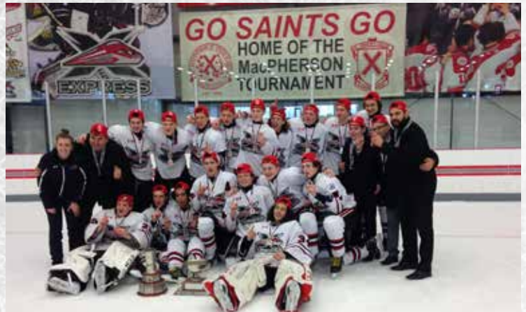
YORK SIMCOE EXPRESS BANTAM AAA