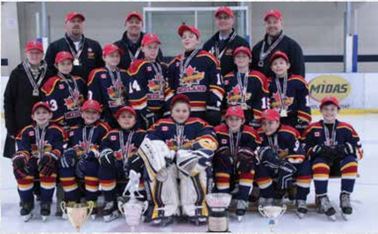
MIDLAND CENTENNIALS ATOM BB