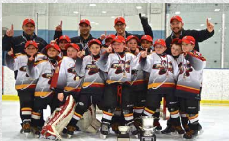
CENTRE WELLINGTON FUSION NOVICE CENTRAL A