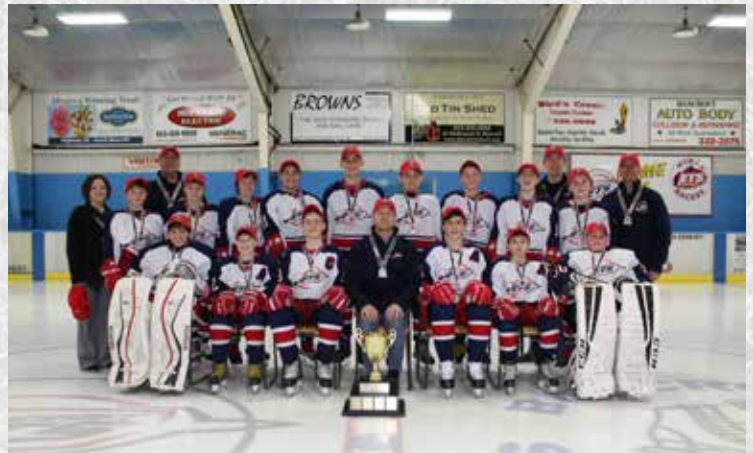
BANCROFT JETS PEEWEE CC