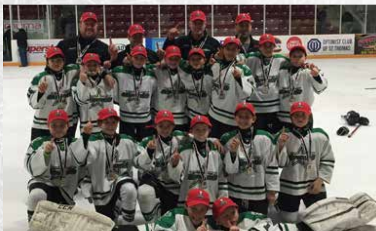
ST. THOMAS JR. STARS MINOR ATOM A