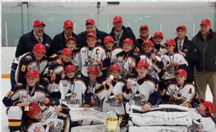
BURLINGTON EAGLES MINOR PEEWEE A