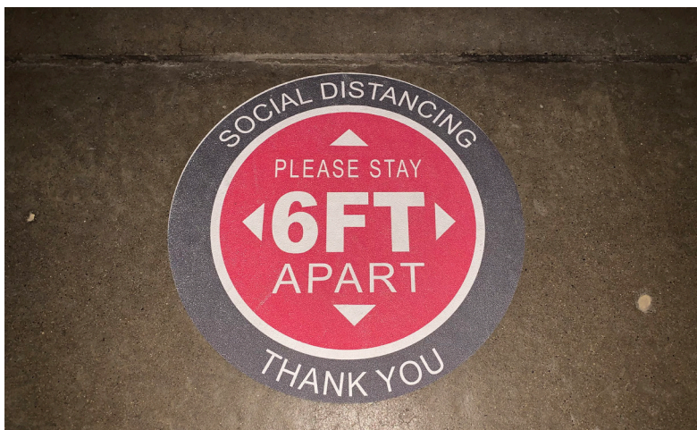
2020-21 WATERLOO BLACK HAWKS