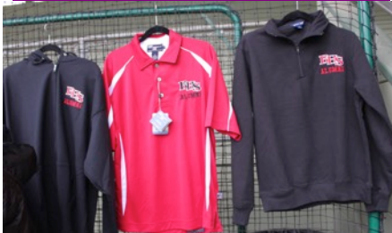
Hoodie, Polo Shirt and ¼ Zip Sweatshirt