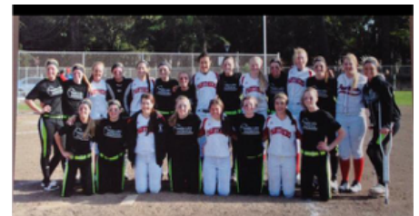
BHS Panthers Playing Maple Lake, MN