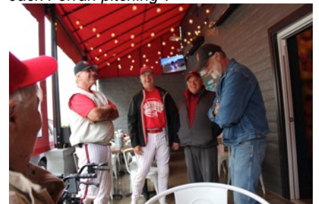
The Get together after the game