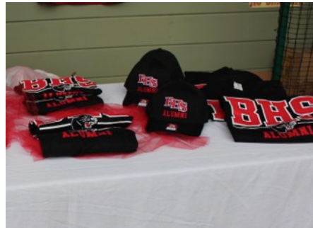
Different Tee Shirts, Black baseball Hats