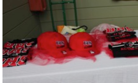
Tee shirts and Red Baseball Hats

To place your order, go to the site above. Please look at the approximate measurements to determine size. All items are unisex. There is a slight variation between brands and it seems the t-shirts run a little small. The qualities of the shirts are very good. We hope to see you wearing your BHS Alumni apparel at all the BHS events.