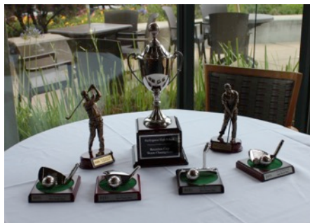
To the victors go the spoils