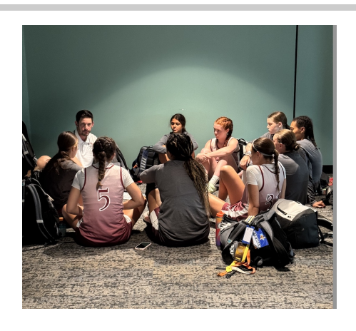
Team meeting before the championship game.