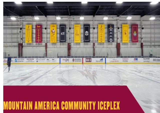
MOUNTAIN AMERICA COMMUNITY ICEPLEX