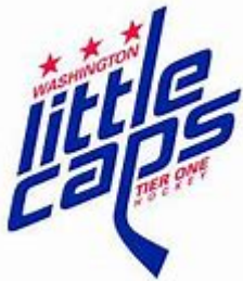
Washington Little Capitals

PVAHA, the governing body of all amateur hockey within D.C., Maryland and Virginia, recognizes the following Tier I programs: