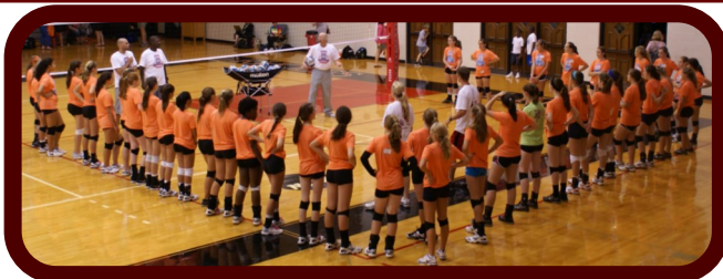
HP CAMP 2012