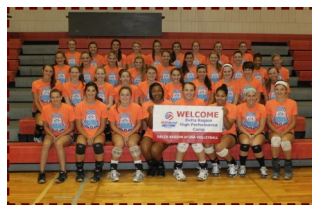
2012 HP Camp

libero, middles, etc. Several of the drills that she will do at the tryout will depend completely on the position for which she is trying out.