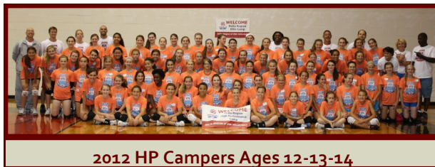
2012 HP Campers Ages 12-13-14

Team members are doing in their practice the very same day in Anaheim, California. While the Delta Region HP camp plan is identical for each camp level, it is geared towards the skill level of the players at each camp. The Delta Region High Performance Program is a regional branch of USA Volleyball's National HP Program. The 2-day training camp is operated to provide junior athletes with high-level training and skill development with some of the top coaches in the country.