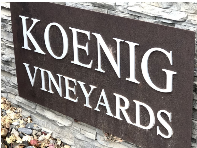
Koenig Winery was very accommodating with their history of the region and wines grown locally.