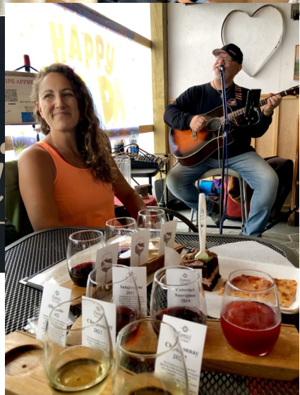
Famici Wine Co was next