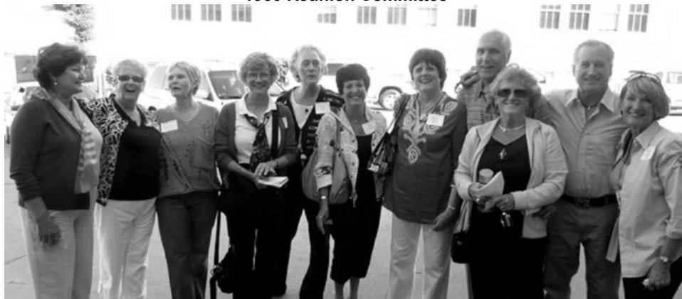
1960 Reunion Committee