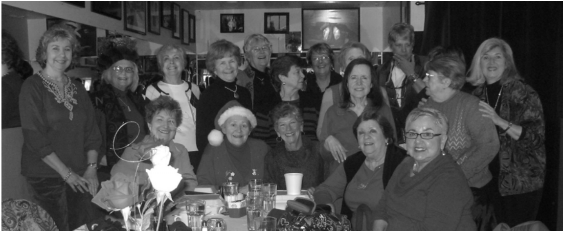
1959 Lunch at Luceti's in San Mateo.