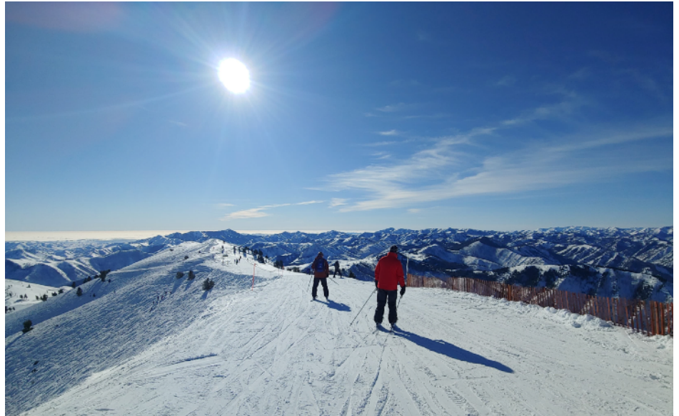
As far as the eye can see! Join us next year!

everyone. I picked runs that were fast and fun, and I enjoyed skiing top to bottom knowing a different burn than I get at our home hill, Bogus Basin. Each day we came across others from our club and chatted across tables while maintaining our social distancing or skied a run or two together before disbanding back into our smaller groups once more. After a mostly cloudy initial ski day, our second day on Baldy offered those world class views as far as one could see. Seriously, aren't these mountain vistas part of why we all love this sport?