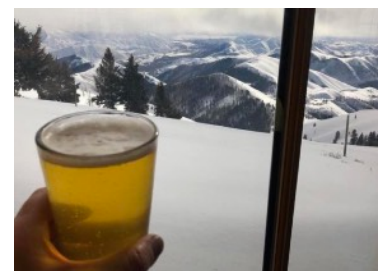
Enjoying our favorite libations at the end of the day.