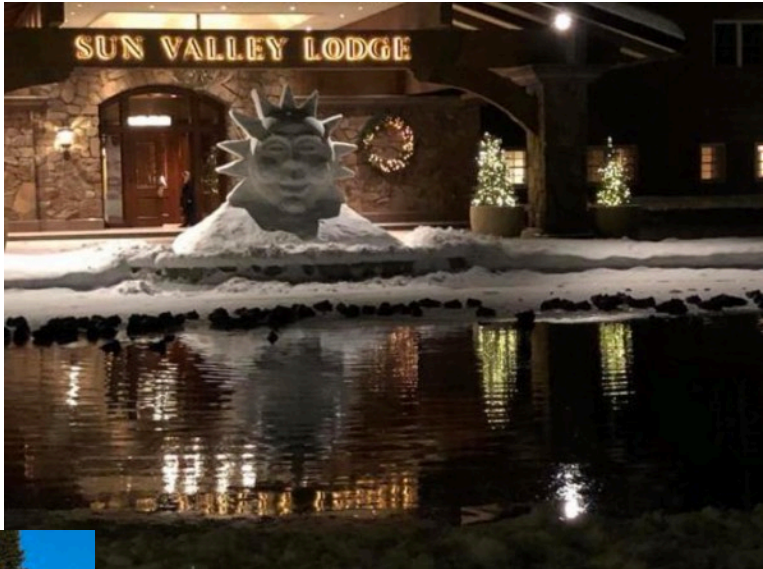
Snow sculpture at Sun Valley Lodge.

2021 marked the sixth year that Intermountain Ski Council (ISC) has held the Ski Trip Rendezvous at Sun Valley January 3-10, 2021, for all ISC member ski clubs to participate. This has been a favorite ski trip destination for BBSC for many years and for many reasons. We were able to hold the Sun Valley trip this year with COVID-19 protocols. This was a self-drive trip with no group transportation; we stayed in small known groups, and we masked when in lift lines or indoors.