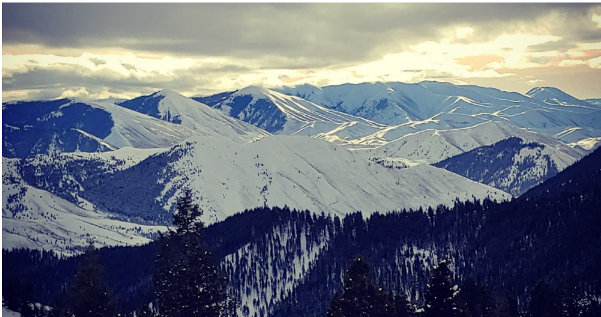
Great mountain view.

A final evening in the steamy hot pools topped off this year's trip. Sure, we had to keep it small due to COVID which is not easy for a social group like ours! However, with so few opportunities to meet up during this pandemic, this was one I'm glad I didn't miss. Put this annual trip on your calendar to join the fun next year!