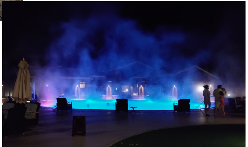
Heated pool at Sun Valley Lodge.

instantly off our shoulders and backs, experiencing basic sensations of life simultaneously. It was amazing!