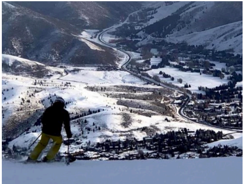
View of Ketchum from the top of one of Sun Valley's long ski runs.

The annual Sun Valley trip was full of fun with thousand-smile days. The condos were so comfortable and close to the lodge. After an incredible day of skiing Baldy, the heated pool was so relaxing. It was great to see some familiar faces grinning from ear to ear, experiencing the magic of Sun Valley. I had a bluebird day. We had a great get together for our annual raffle drawing. There was free beer while we watched the sunset over Mt Baldy. I am looking forward to next year.