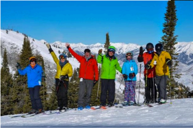
Happy BBSC skiers at Sun Valley on a bluebird day.

Twenty-six BBSC members participated in the Rendezvous this year, and most of us did not see much of each other except when we were skiing.