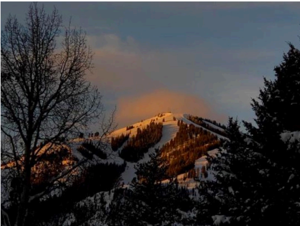
From our condos we viewed the glow of the sunrise on Baldy on a bluebird day for skiing.